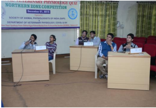
Quiz in progress