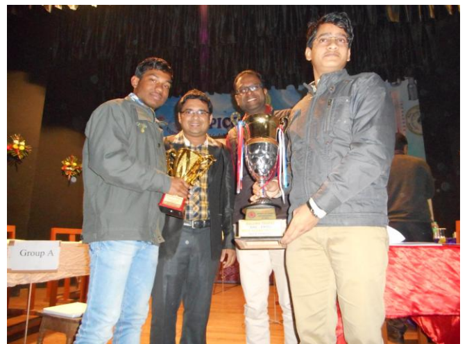
Winner team with trophy