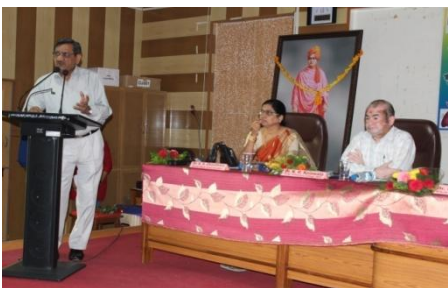
Address of Hon'ble Vice Chancellor, NAU