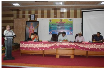
Dean, Veterinary College, NAU, Navsari - Welcome address