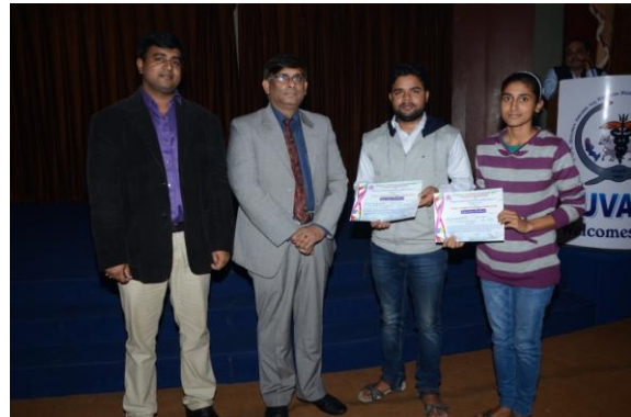
Team DUVASU, Mathura