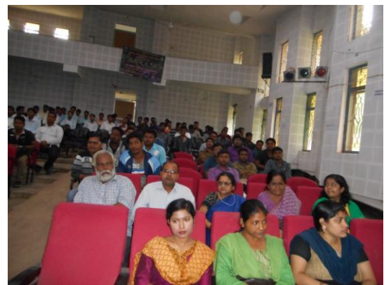
A part of the audience of zonal quiz