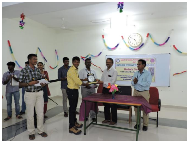
The winner team of Southern zone SAPI Quiz