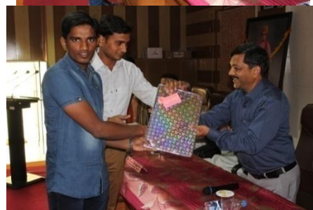
Felicitation of other participants