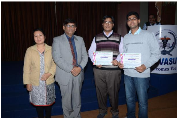
Team GBPAUT, Pantnagar