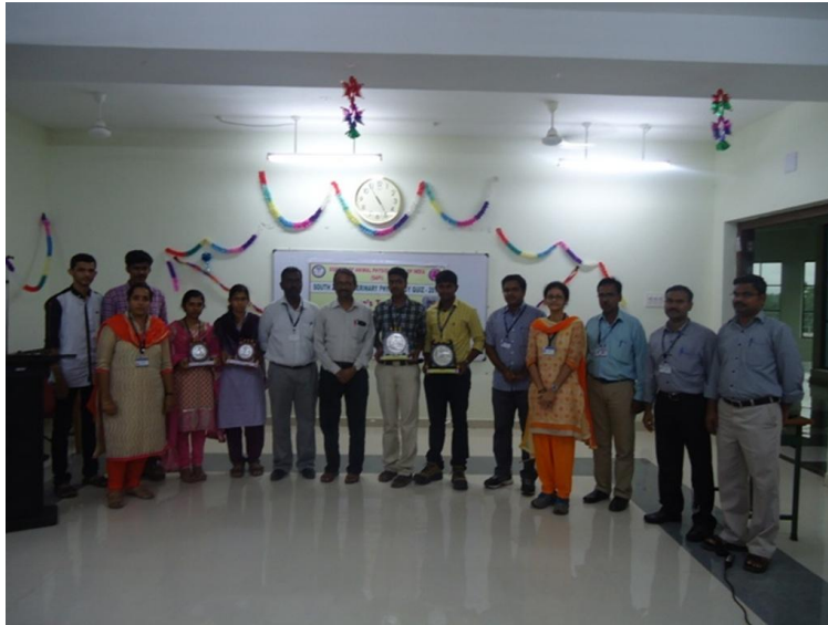
All the four participating team at final level quiz at zonal competition