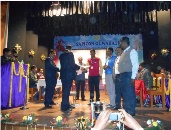
Southern zone ranked second