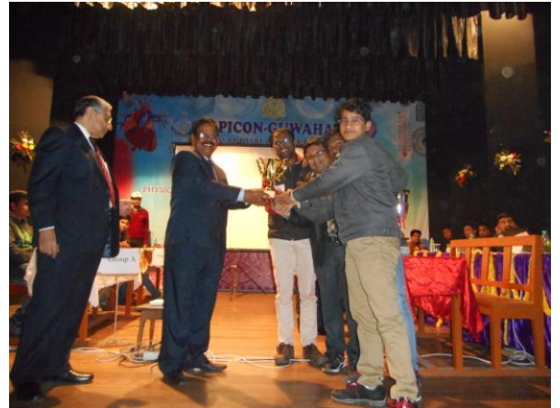
Winner team OUAT is awarding