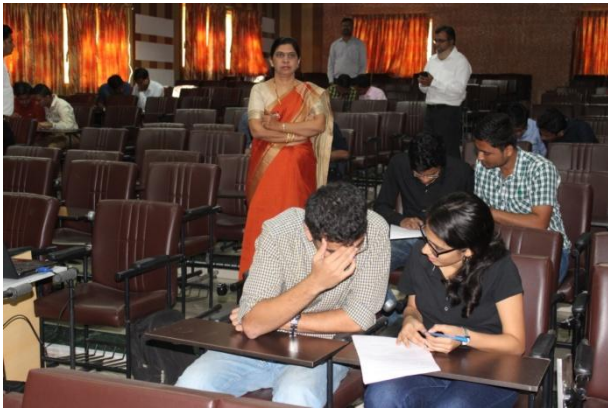
Teams from different colleges at pre-qualifying competition for west zone quiz