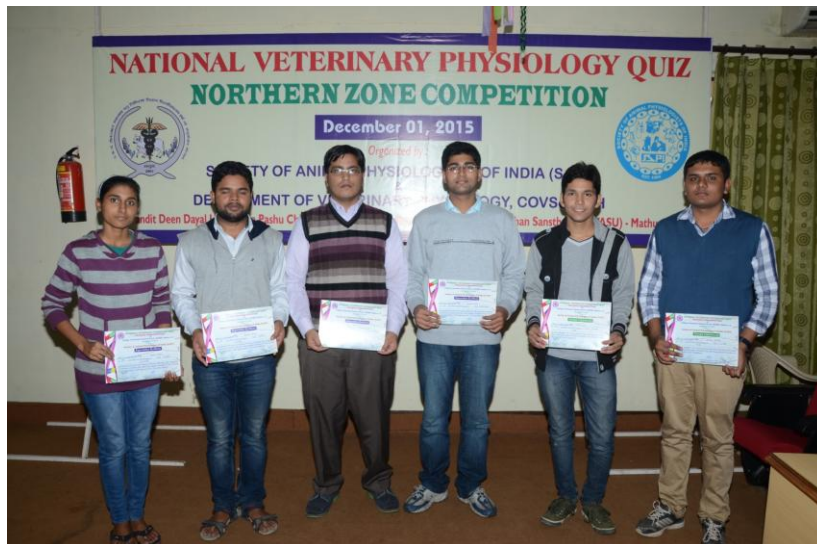
Participants of North Zone