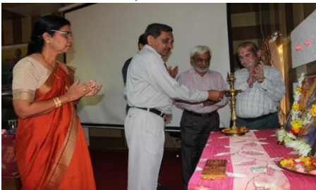
Hon'ble Vice Chancellor, NAU along with other dignitaries lighting the lamp during inaugural function