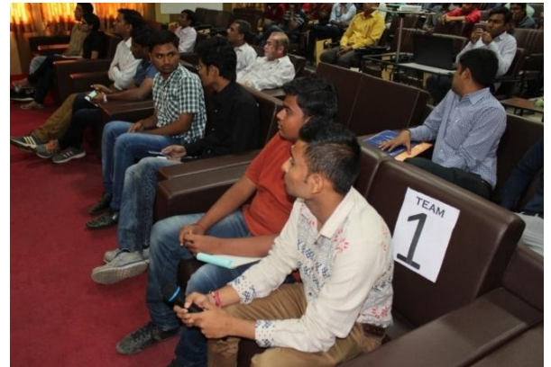
4 teams that contested the west zone veterinary physiology quiz competition