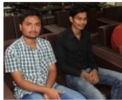
Veterinary college, Nagpur