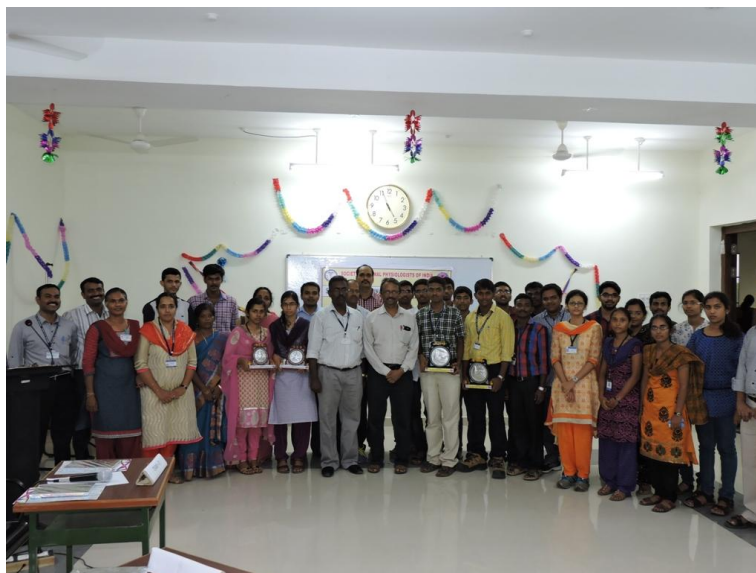
All the participating teams and organizing committee