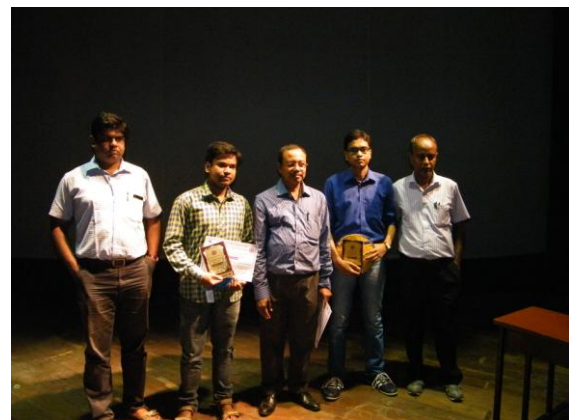
Winner team of institute level competition at WBUAFS