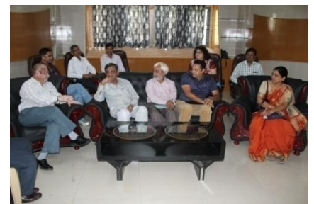
Eminent members present in a brief meeting during the function