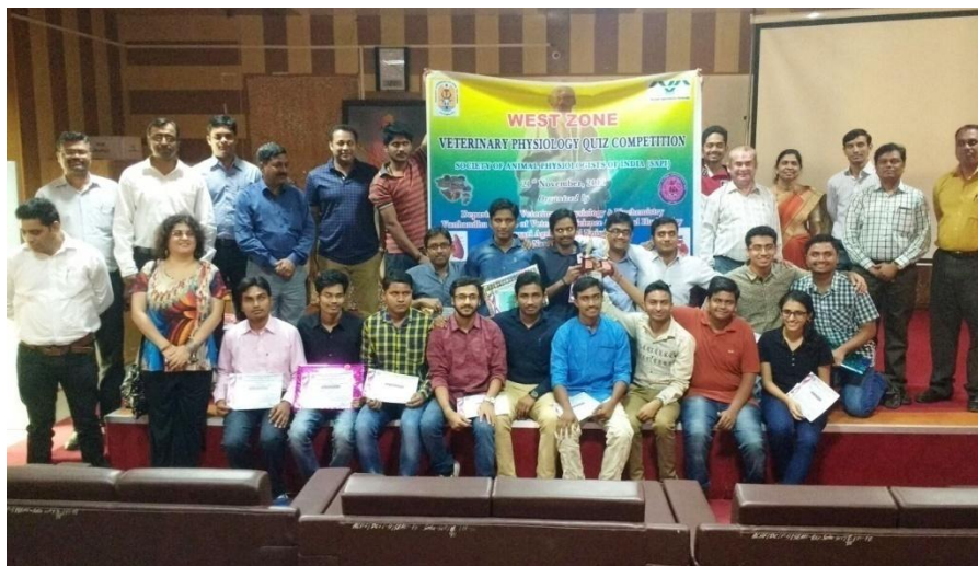
All teams along with accompanying staff as well as faculty from host college after the quiz.