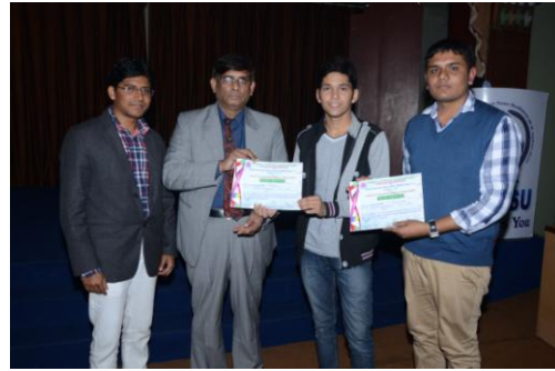
Winning team (LUVAS, Hisar) with their mentor