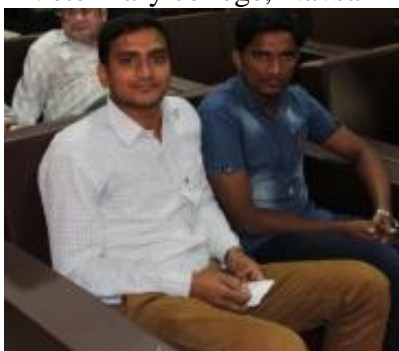
Veterinary college, Sardarkrushinagar