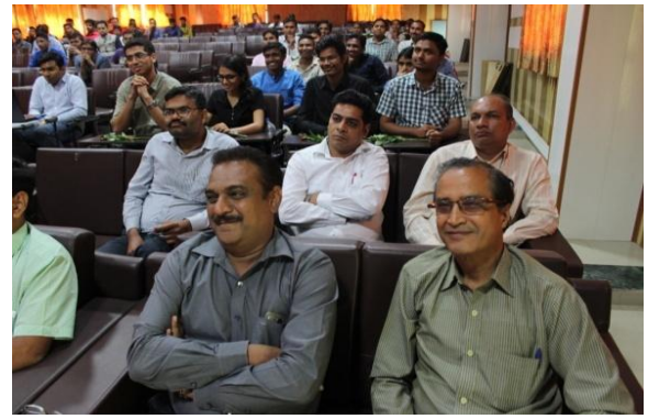
Audience comprising faculty and students of host veterinary college along with participating teams