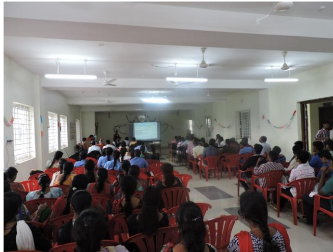
The Audience of Southern level zonal quiz