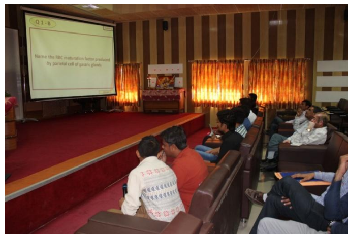
Quiz rounds in progress