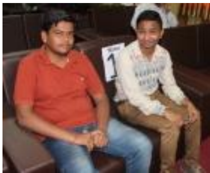
Veterinary college, Navsari