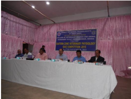
Dignitaries were in the dias in zonal quiz