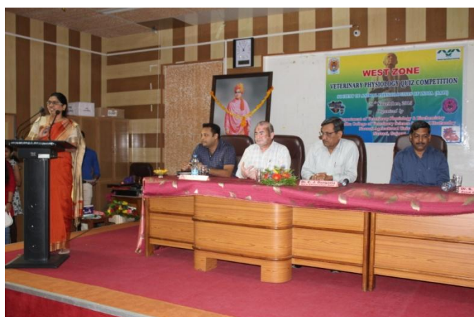
Announcement of the results after quiz