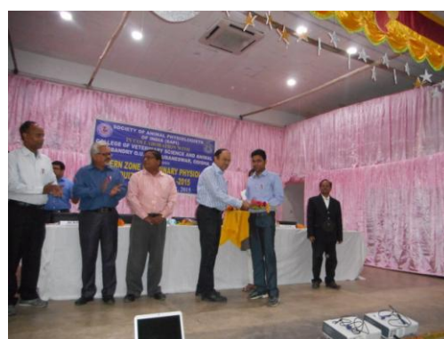
Accompanying teachers were felicitated