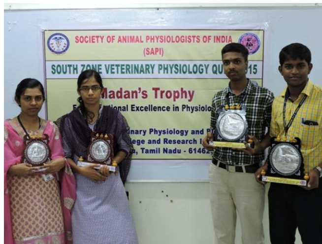
The Winner and runner team of Southern level zonal quiz