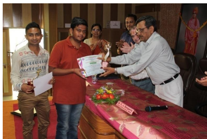
Hon'ble Vice Chancellor, NAU felicitating winning team of Veterinary college, Navsari