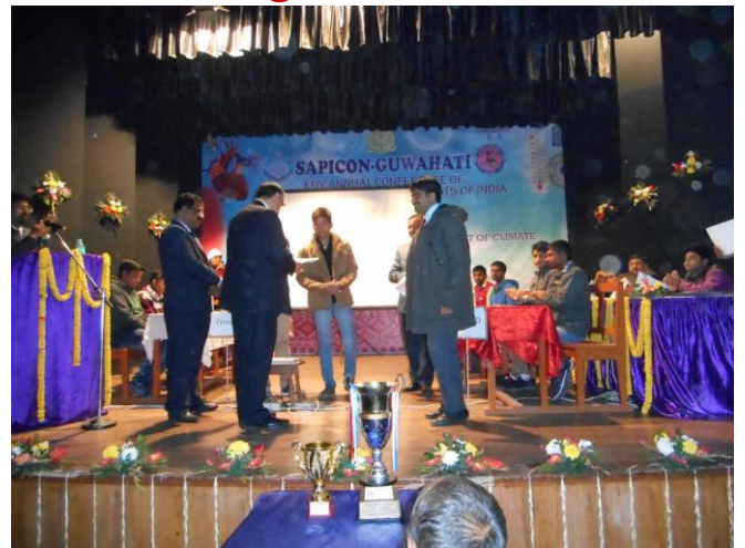
Northern zone ranked third