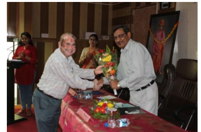
Dean, Veterinary College, NAU, Navsari offering floral welcome to Hon'ble Vice Chancellor, NAU