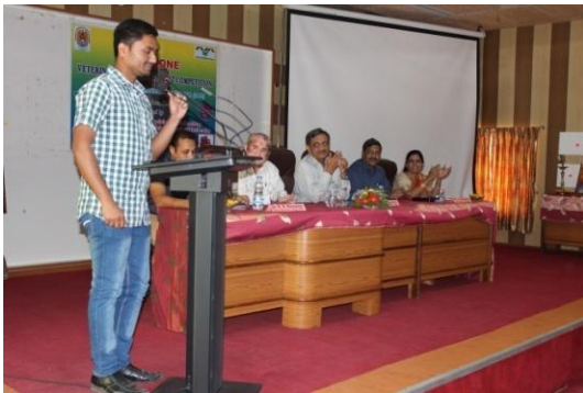
One of the student of participating teams sharing some pleasant experiences of the quiz