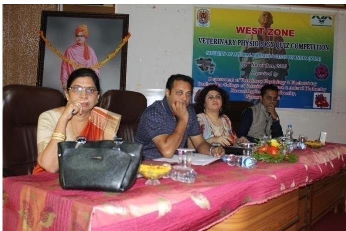
Members acting as jury, for scoring and keeping time during the quiz.