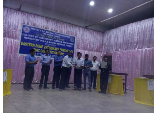
Prize distribution programme in zonal quiz