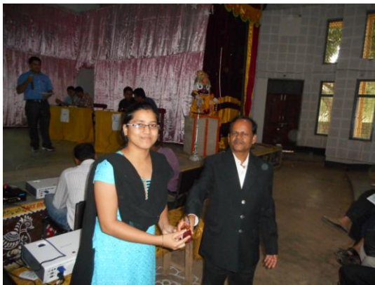
Budding physiologist award presented to students from audience in zonal quiz