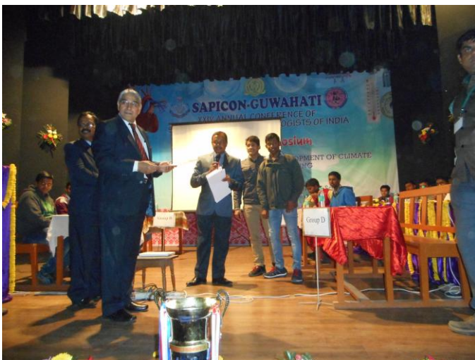
Final result is announcing